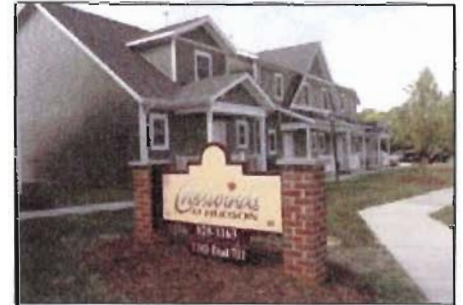
The main entrance to Crosswinds is on Harry Howard Avenue in Hudson.